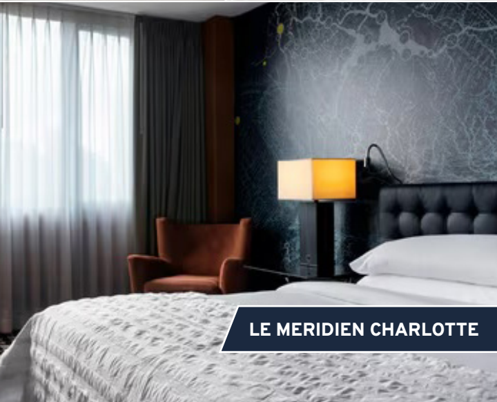
LE MERIDIEN CHARLOTTE